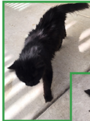
Enjoying the sun on an enclosed patio!