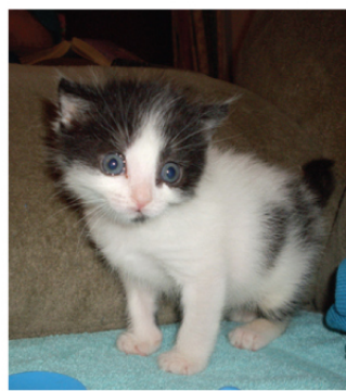
Kitten at 2 weeks.