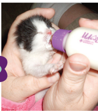
Newborn removed too soon.