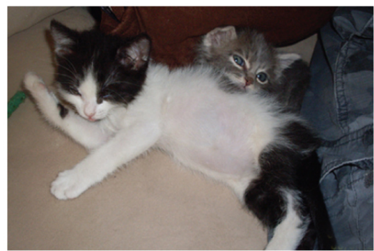
5-6 week old kittens ready to be rescued with mother.

Every spring, LVVHS receives multiple calls along the following lines: "I found a litter of kittens when I was cleaning my yard, I brought them in, and I don't see a mother. Please come and pick them up...". Please take a step back when you see that litter of kittens in your yard, or your neighbor does and asks your opinion. First, leave them alone—particularly if it's clear their eyes aren't open. The mom may be taking a break or she heard you and ran. She will be back—maybe not until that night. BUT, she will be back. So leave them alone. If you want to provide food to the mother, do so AWAY from the kittens. She will find it.