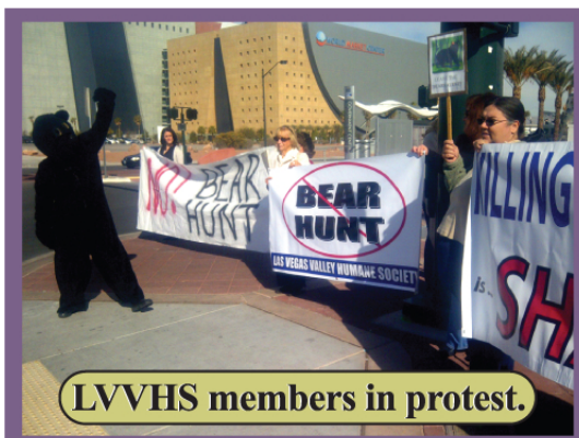
LVVHS members in protest.

The LVVHS testified against the proposed regulations of a Black Bear Hunt in Nevada at a meeting of the NV Wildlife Commission on February 4, 2011. This was the second time that the LVVHS had testified against the hunt. The first time was the NV Wildlife Commission meeting in Las Vegas on September 24-25, 2010 where the first proposal for the First Season Bear Hunt was made. At that time the LVVHS spoke