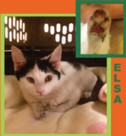
E L S A

We received a call to our hotline about kittens dumped in a parking lot at a shopping center. It was one of the hottest days of the year. When we arrived, we were told that a passerby picked up one of the kittens and another person had left Elsa in a box outside the store. We searched the parking lot, but did not find other kittens. The asphalt was so hot, it severely burned Elsa's pads. She has since healed from her burns and has found a loving forever home.